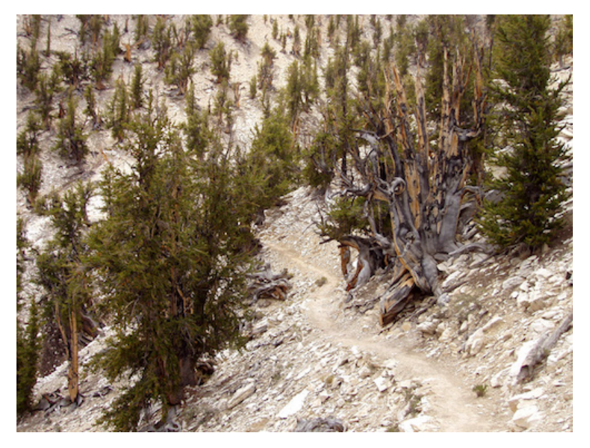
IMAGE 4: This is said to be the Methuselah Tree, one of the oldest living trees in the world. Methuselah, a bristlecone pine tree in White Mountain, California is thought to be almost 5,000 years old.