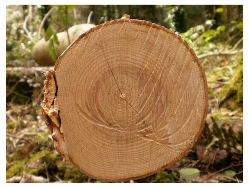
IMAGE 2: The light and dark rings of a tree.

5) These rings can tell us how old the tree is and what the weather was like during each year of the tree's life. The light-colored rings represent wood that grew in the spring and early summer, while the dark rings represent wood that grew in the late summer and fall. One light ring plus one dark ring equals one year of the tree's life.