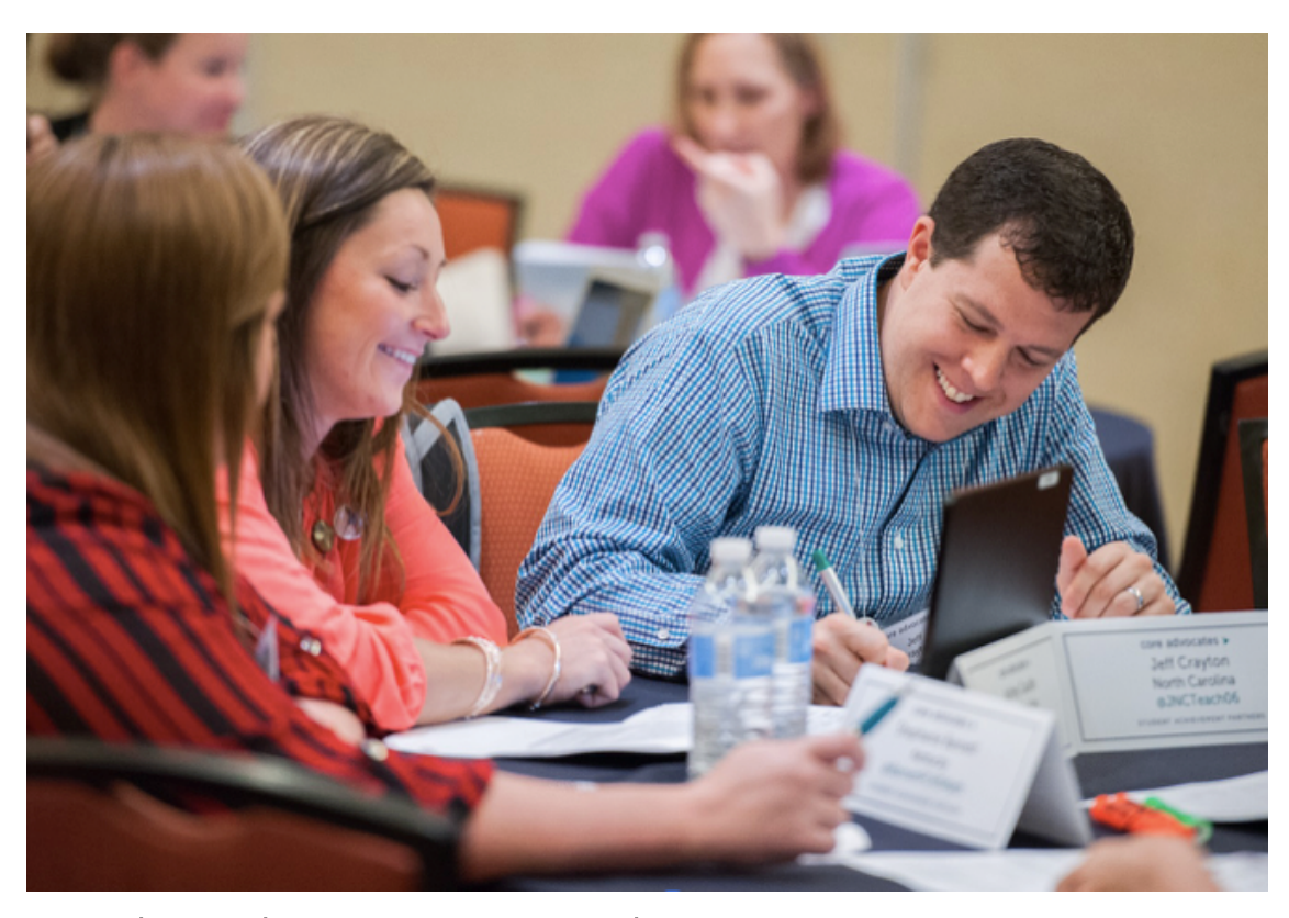
National Core Advocates Convening - Applications Now Open