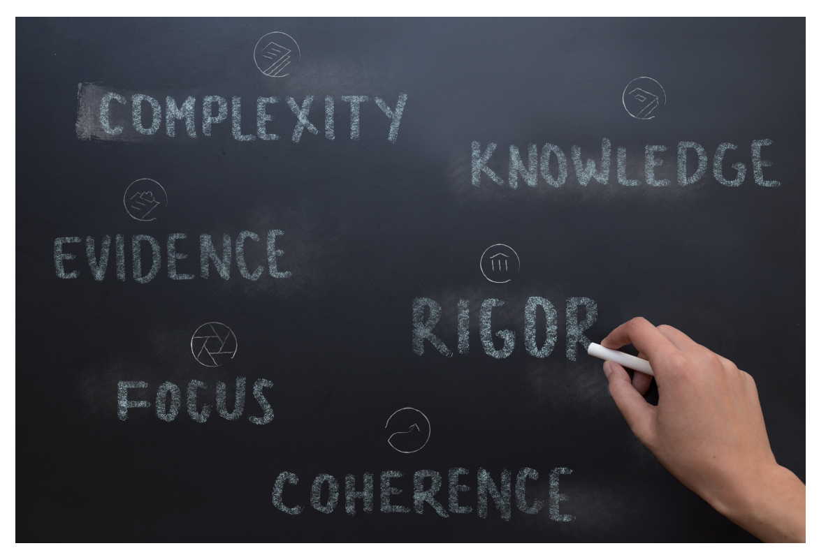
Instructional Advocacy Action Form Spotlight

Core Advocates from around the country are making an impact on educators and