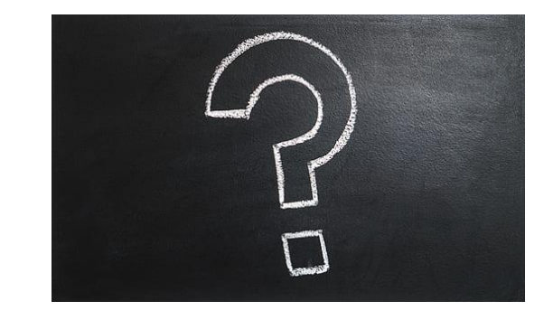
Q&A to follow breakout conversations!