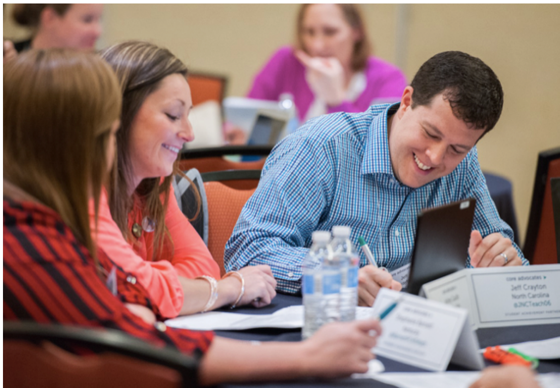
National Core Advocates Convening – Applications Now Open